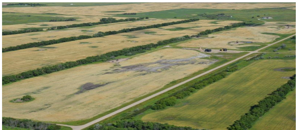
Our Bottineau County Salted Lands Tour visited this site with the gray black dead zone. Salt is so concentrated that not even salt tolerant foxtail barley will grow.

Banks are aware. So are well-informed buyers. Will lands like this be unsalable?