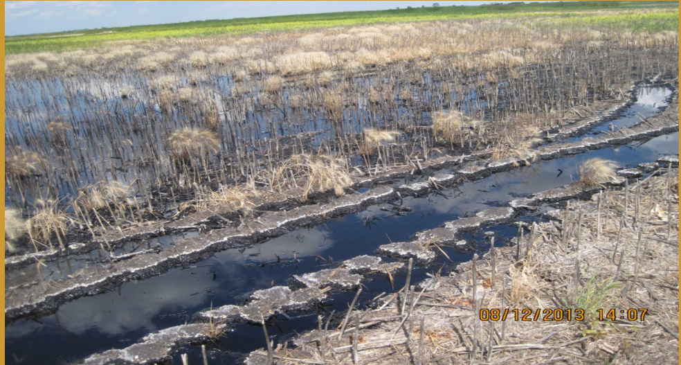
Artz Well Salt Water Disposal Line under this barley ground was unattended for 30 days.

It's cost of cleanup, now in millions, continues in Dec 2013.